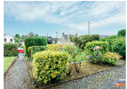
22 Saintfield Road